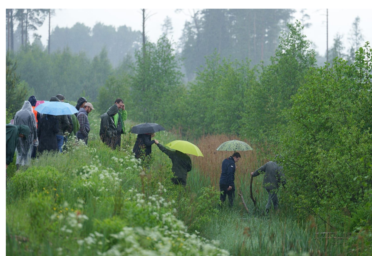
Biomass production in buffer zones.