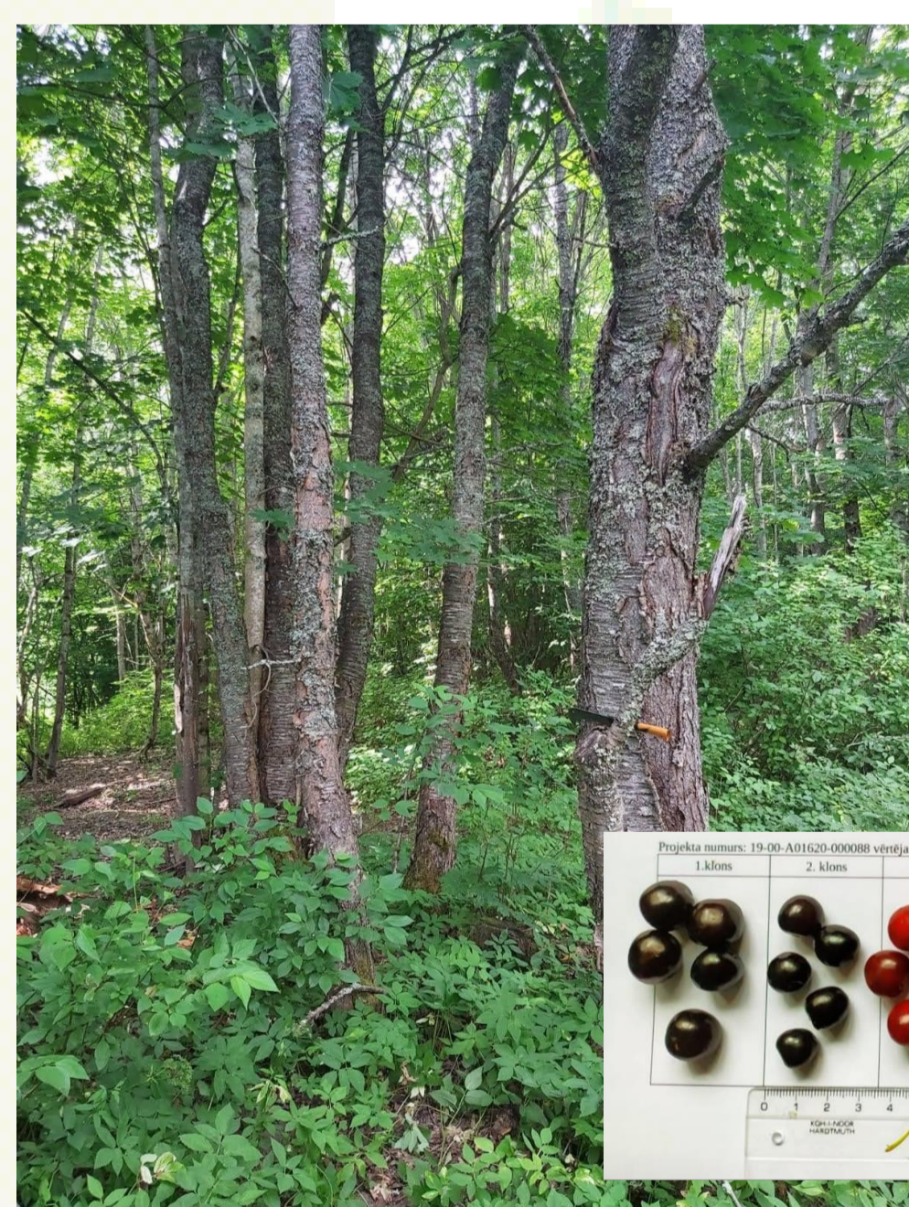
Native sweet cherry in forest stand and selection of perspective clones of wild cherry