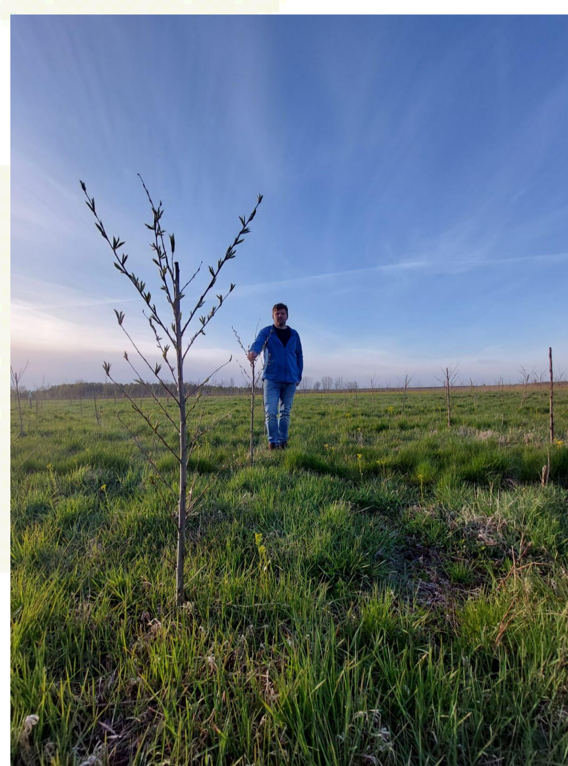
Agroforestry system combining fast-growing Poplars with perennial grass in agricultural land with organic soil in Rucava