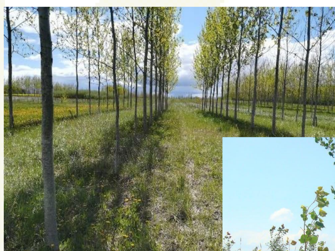
Hybrid aspen agroforestry system in agricultural land with mineral soil in Skrīveri