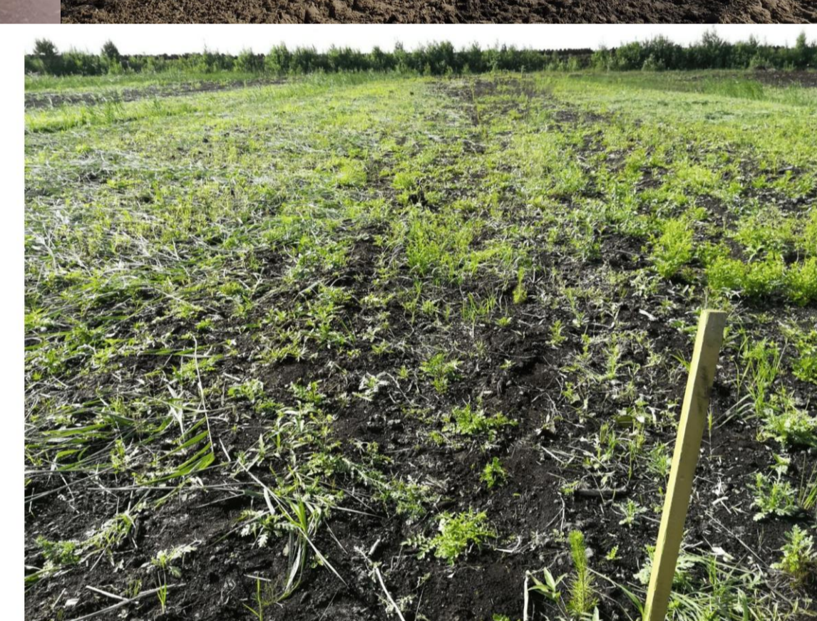
Scots pine, black alder and birch introduction in organic soil fertilized with wood ash (Kaigu Mire)