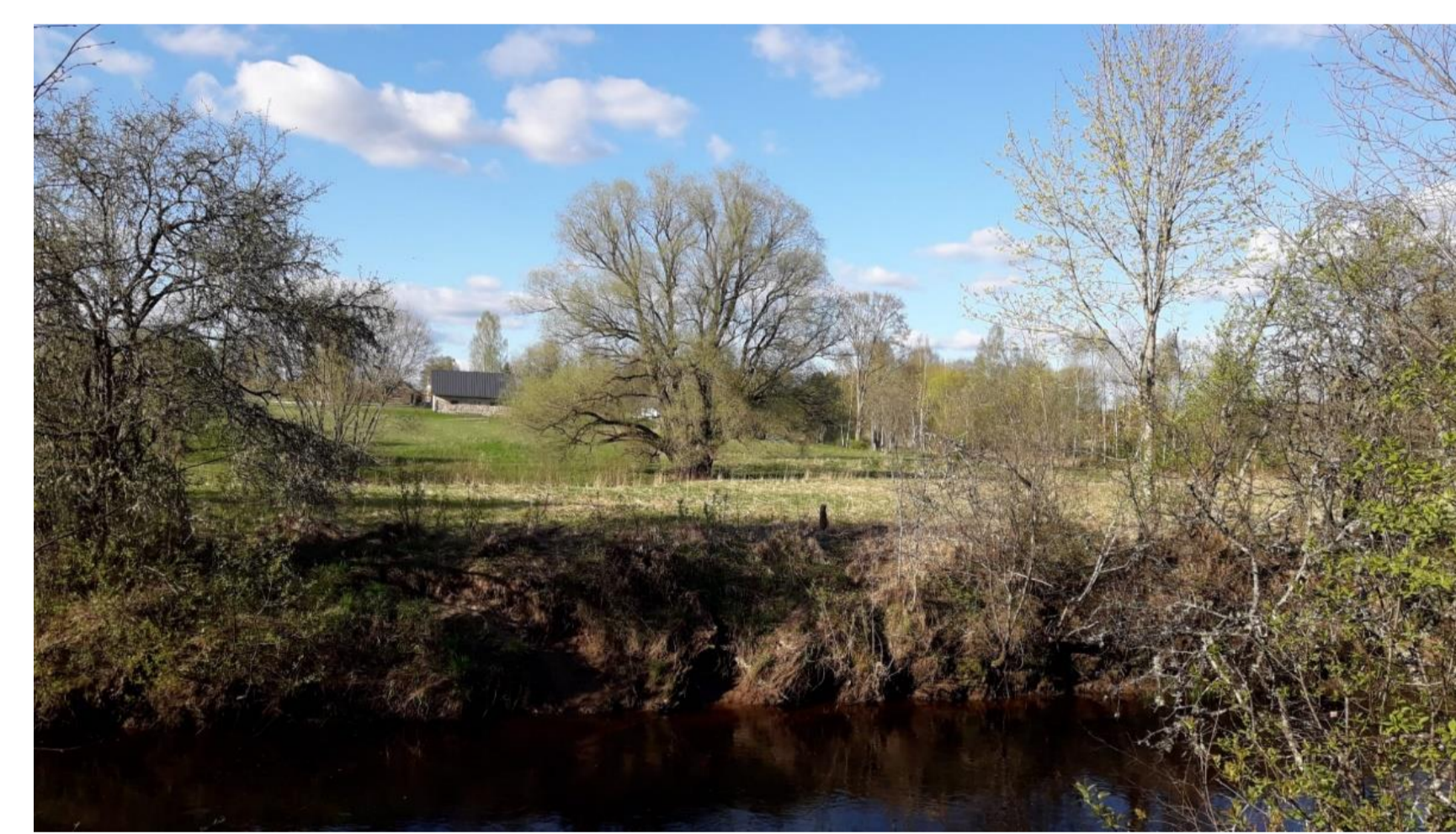
The largest white willow in the Baltic States in former shelter belt