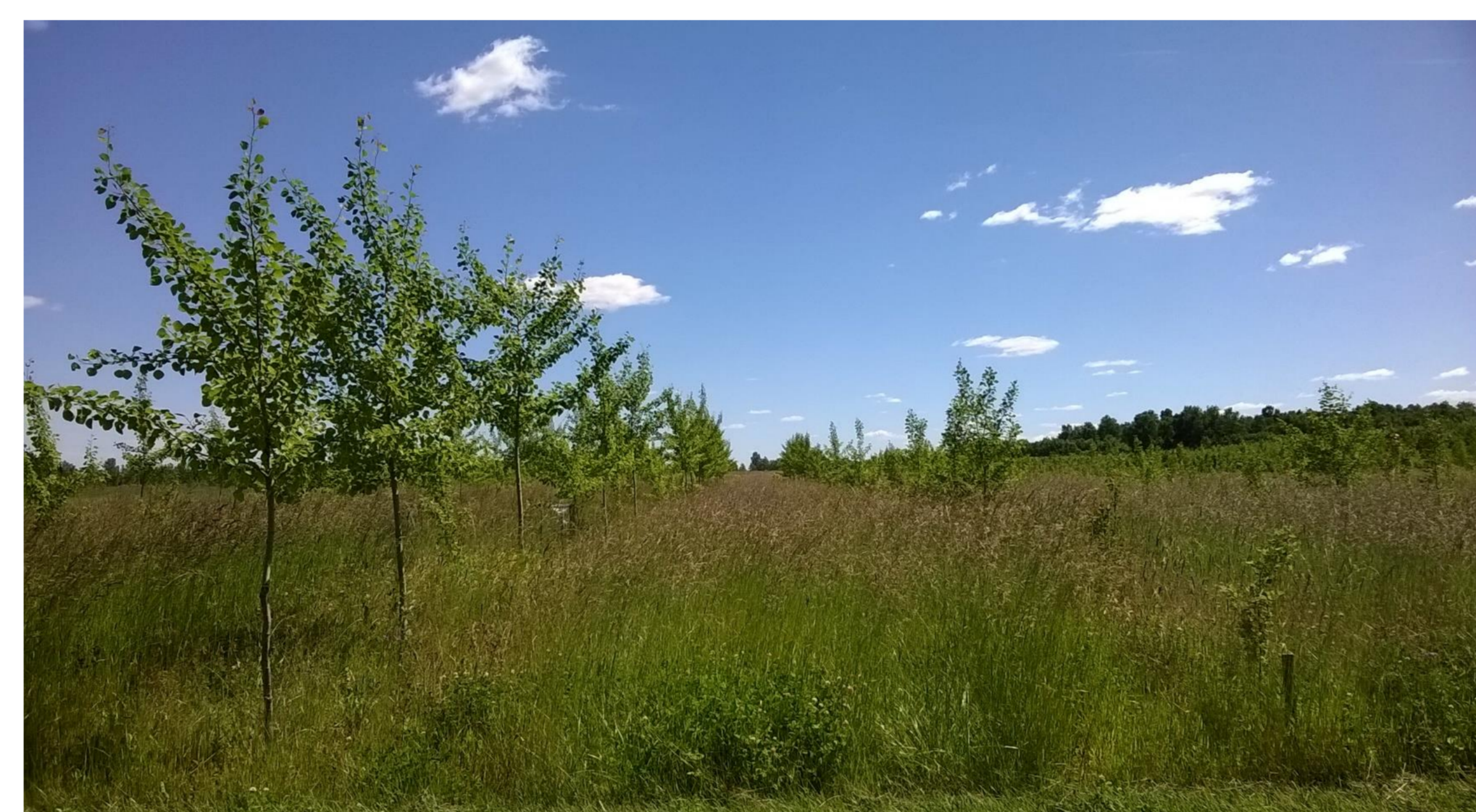
xFestulolium pabulare intercrop