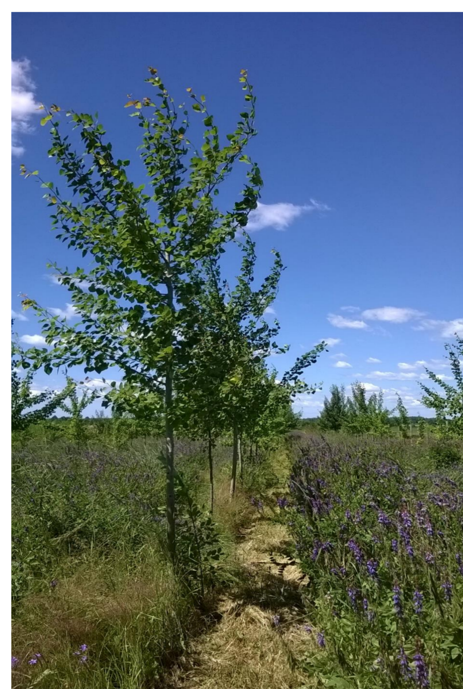
Galega orientalis Lam. intercrop