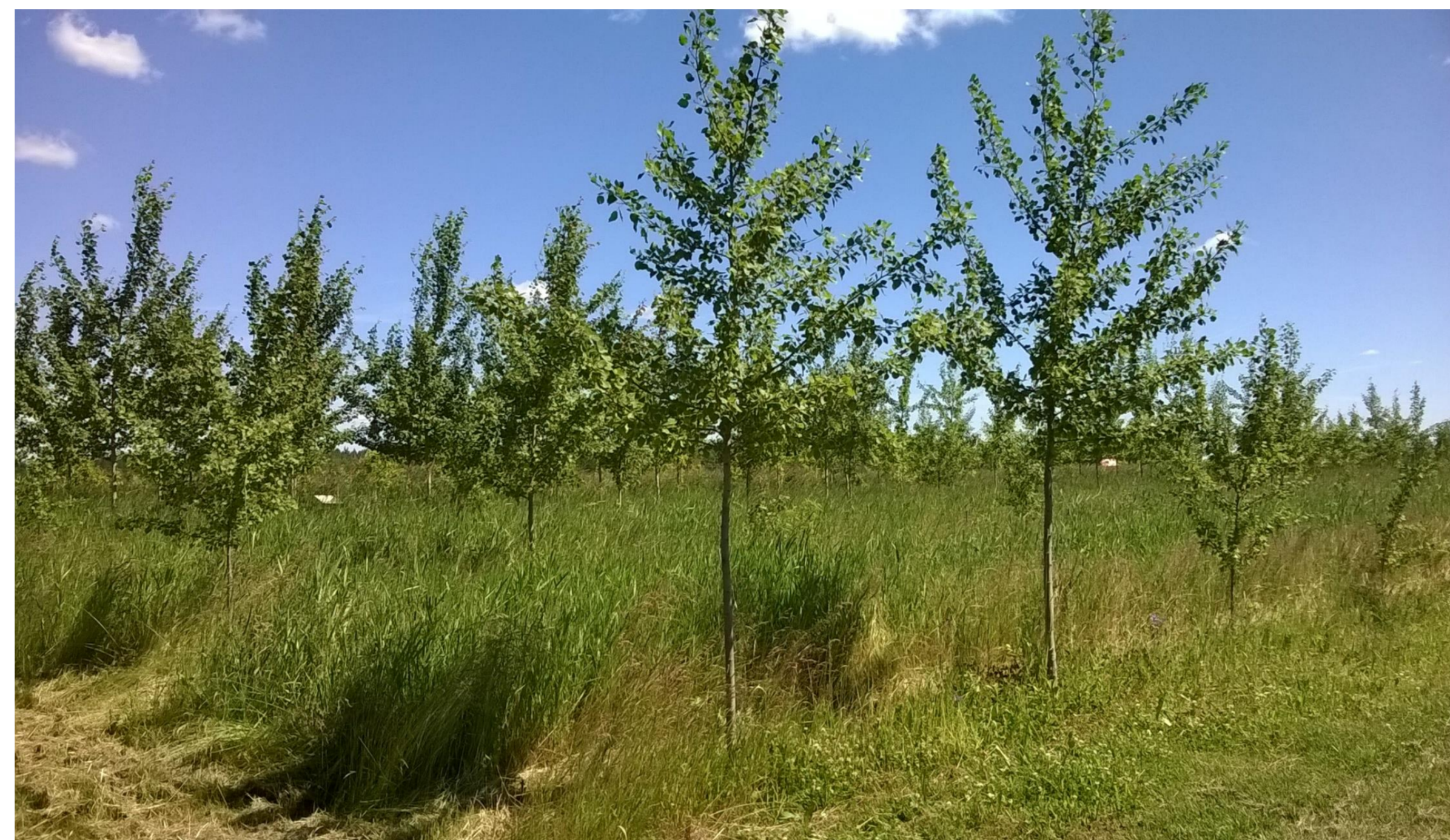
Phalaris arundinacea L. intercrop