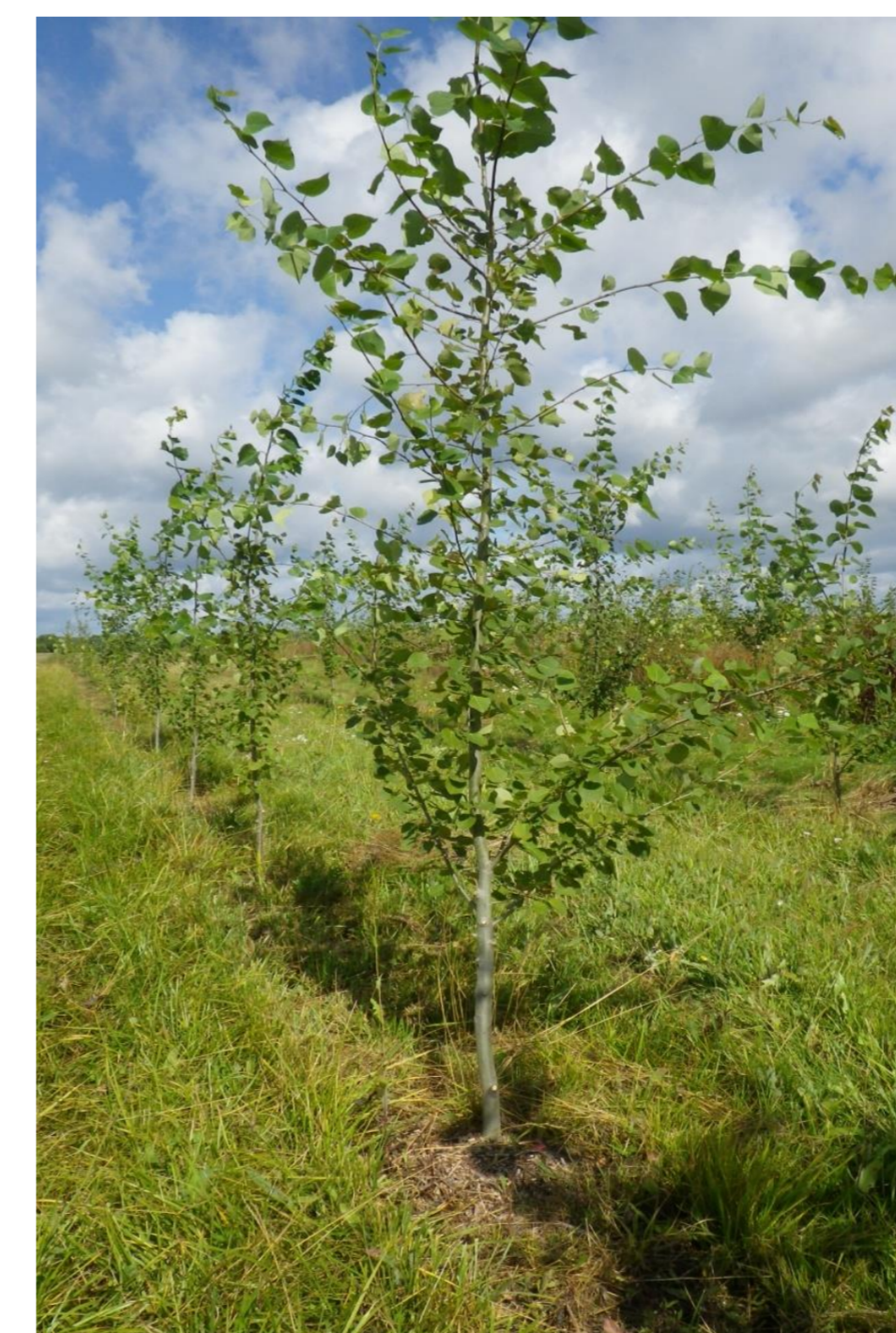
Populus tremula x P.tremuloides

Comparing fertilizers efficiency - it is recognized that the best effect on tree growth for both clones gives fertilizing with biogas fermentation residues (digestate) and waste water sludge, averagely 30–31% better tree height compared to control.